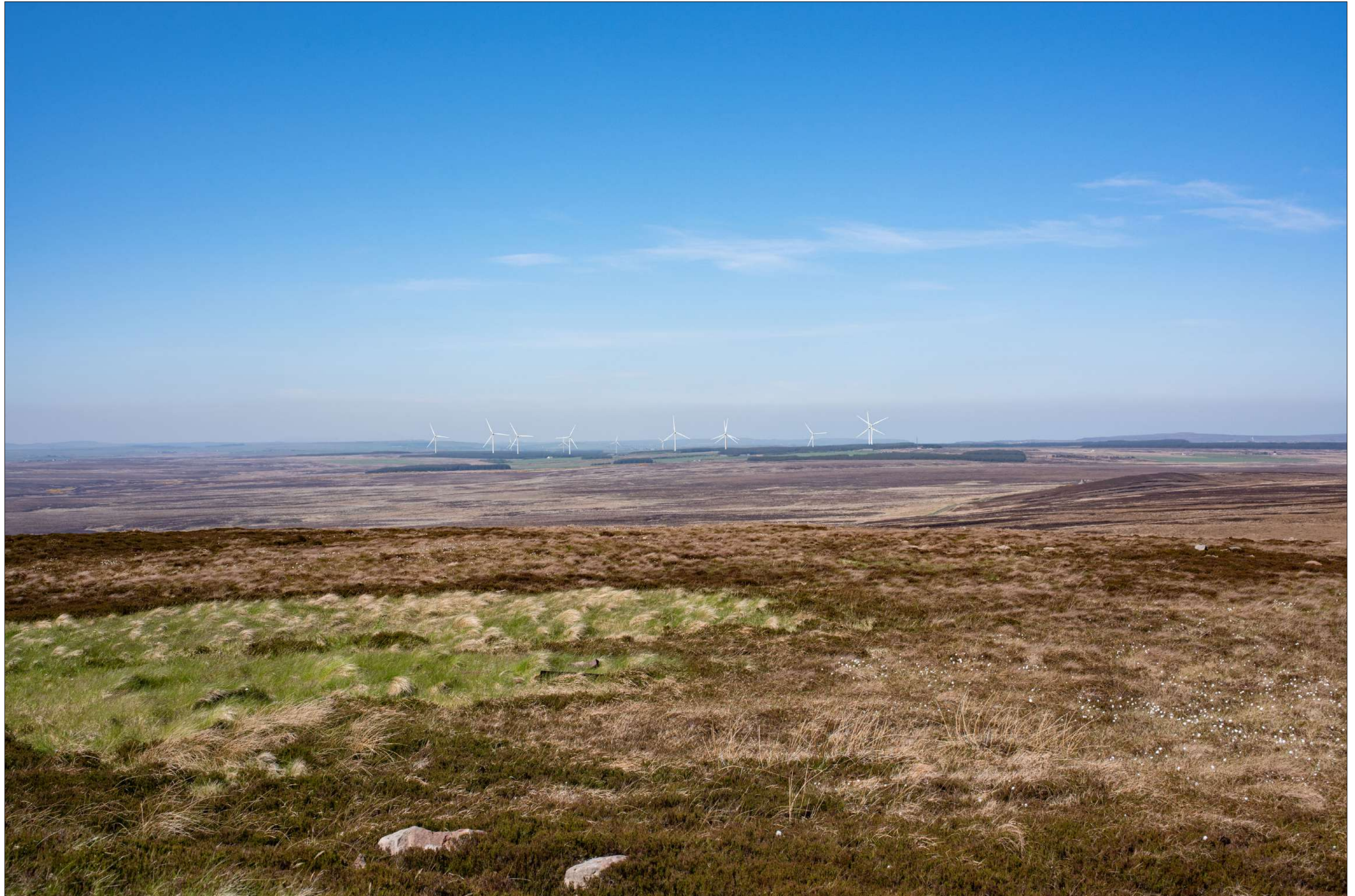
Figure: 7.23-THC-03 Viewpoint 10: A99 Warth Hill

When viewed at a comfortable arm's length (approx. 500 mm), this printed image is representative of our detailed central vision, but is not representative of scale and distance.