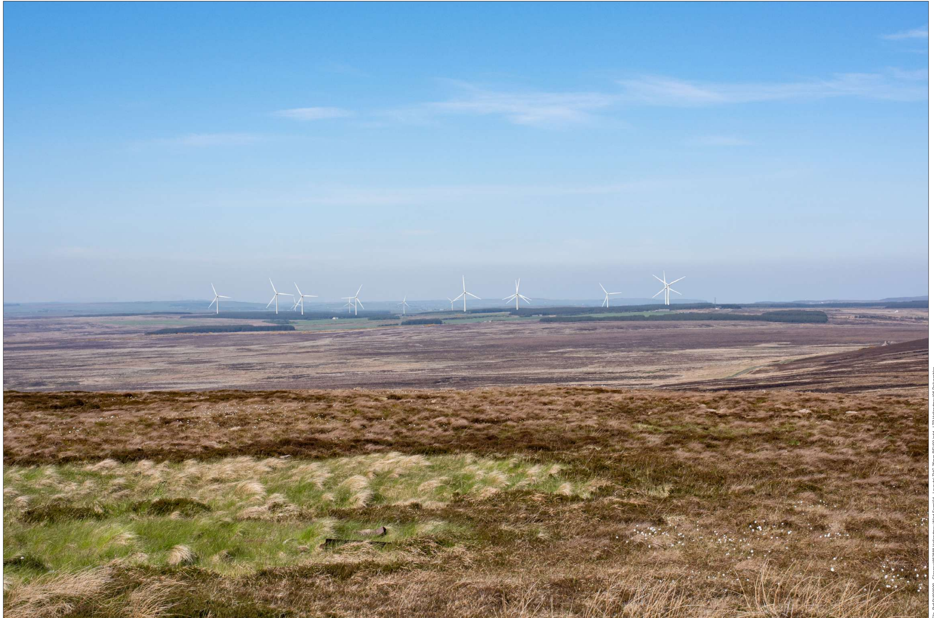
Figure: 7.23-THC-04 Viewpoint 10: A99 Warth Hill

This image should be viewed at a comfortable arm's length (Approx. 500 mm)